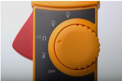
Ohm Setting on Voltmeter

Begin your test by unlocking and removing the battery pack from your Electrolite. Remove the suspect fuse, either charging or output fuse depending on the troubleshooting situation. Set your volt meter to the OHM/Resistance setting. Connect volt meter leads across suspect fuse. Meter should show very little resistance across fuse if fuse has continuity. If high resistance or OL/Open Load is shown, replace fuse.