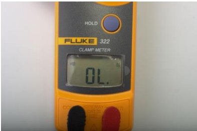
No Continuity, Replace Fuse